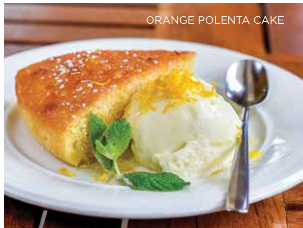
ORANGE POLENTA CAKE

HOUSE MADE GELATO Vanilla, Chocolate, Salted Caramel, Seasonal Flavour